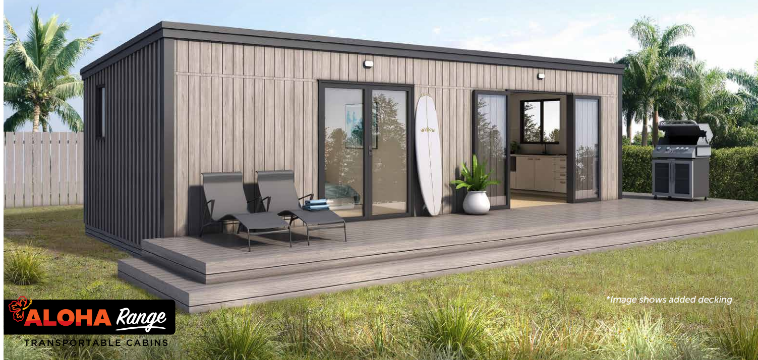
*Image shows added decking

New Zealand's Biggest Tiny Homes Showyards